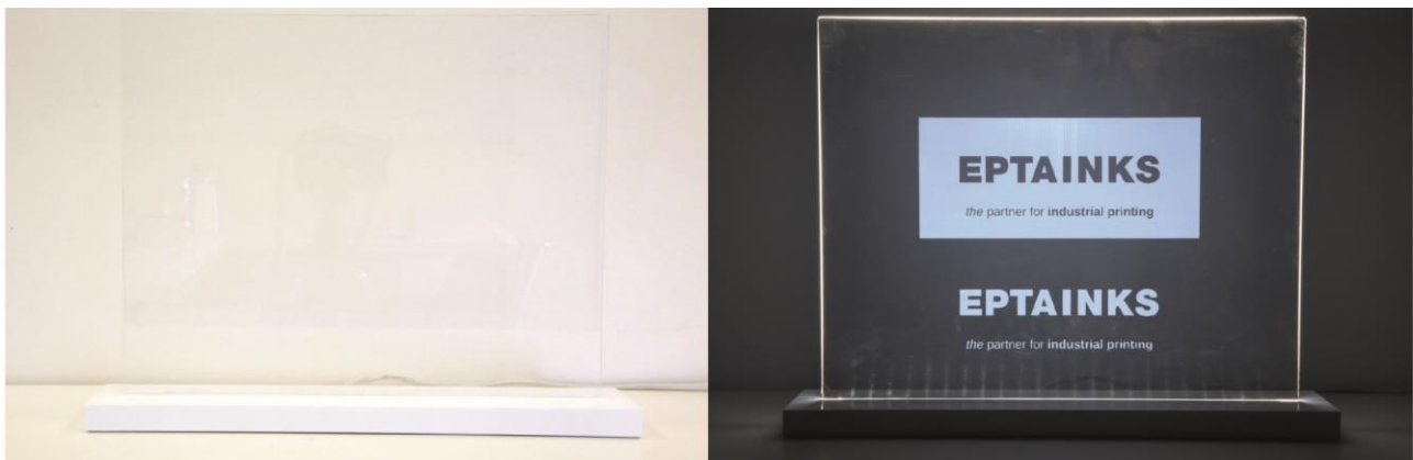
Figure 4: Prototype printed with the light diffusing ink